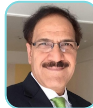
Dr. Subhash Chandra